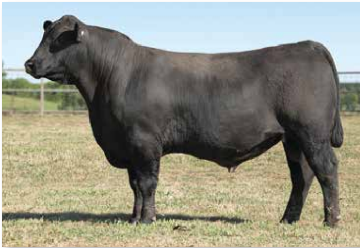
Lot 26 | TANNER BLUE SKY 3144