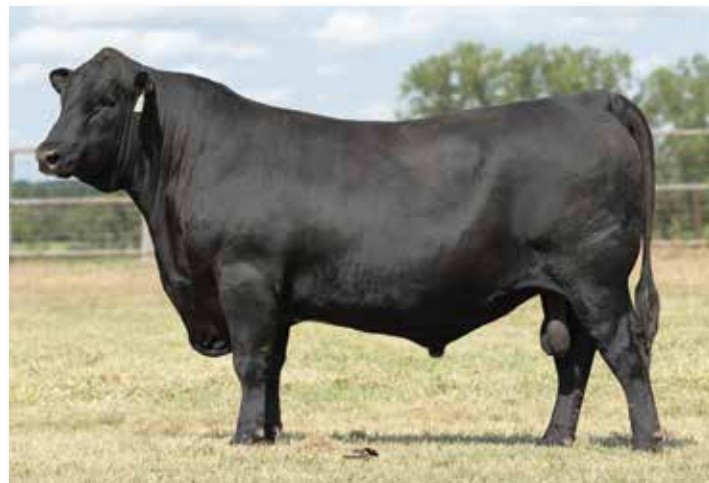
Lot 52 | TANNER MOONDANCE 3254

A son of Whitestone Moondance 0019 with 8 leading traits. Top 20% WW, Top 25% YW, Top 30% CW, $W and $F, Top 35% Milk, Marb and $B. His dam posts 1 @ 94 BR, 1 @ 108 WR and 1 @ 107 YR with her 1st calf. Excellent Weaning and Growth, Milk, Marbling with Calving Ease.