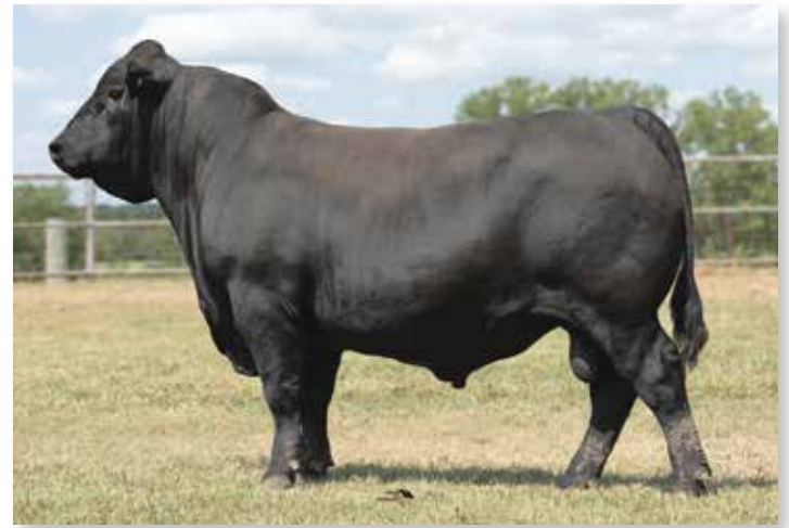
Lot 7 | TANNER POWERBALL 2925

A son of Roseda Powerball23 F091, one of several half brothers offered in sale with 9 leading traits. Top 2% YW, Top 3% WW, Top 10% $F, Top 15% CW and RE, Top 20% $B, Top 30% $W, $G and $C. His dam posts 2 @ 98 BR, 2 @ 109 WR and 1 @ 114 YR with an average 373 day calving interval on 2 head. Outstanding Weaning and Yearling Growth. Yearling Weight 1313 lbs Big Ribeye 15.6 cm