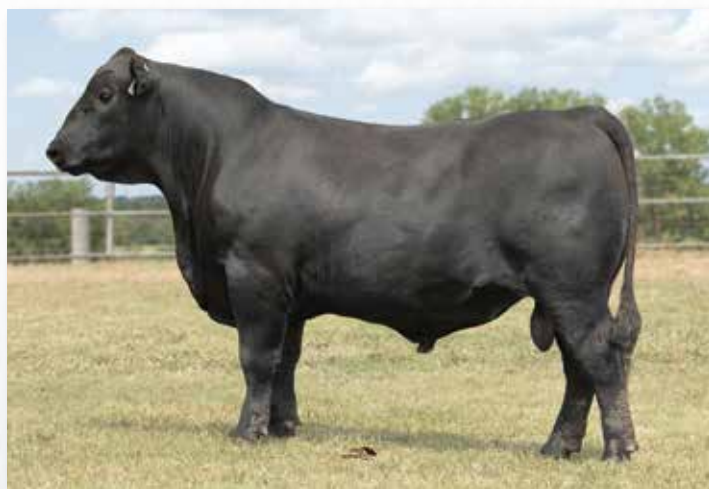
Lot 59 | TANNER PROPHET 32201

A grandson of GAR Prophet with a Top 35% $M. His dam posts 5 @ 98 BR, 5 @ 102 WR. Should add Milk to Replacement Females.