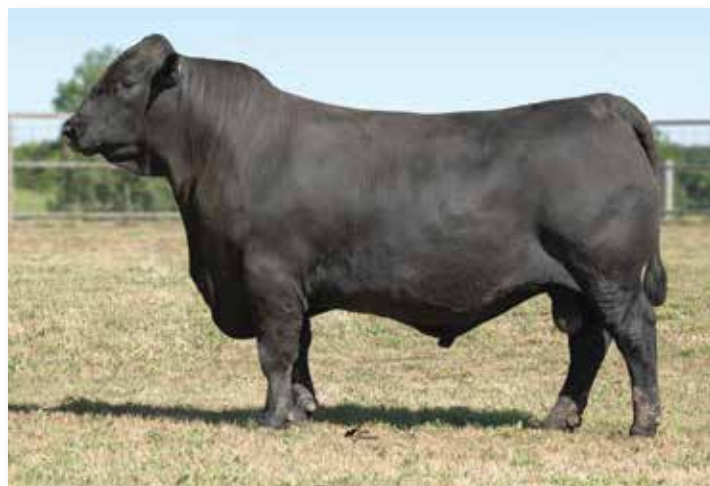
Lot 5 | TANNER SUMMATION 2922

A son of KCF Bennett Summation E802, one of several half brothers offered in sale with 11 leading traits. Top 5% YW, Top 10% WW and $F, Top 15% CW and RE, Top 20% $W, $B and $C, Top 25% CED and Milk, Top 35% %M. His dam posts 2 @ 109 WR and 2 @ 110 YR with an average 370 day calving interval on 2 head. Outstanding Growth with Calving Ease plus Milk