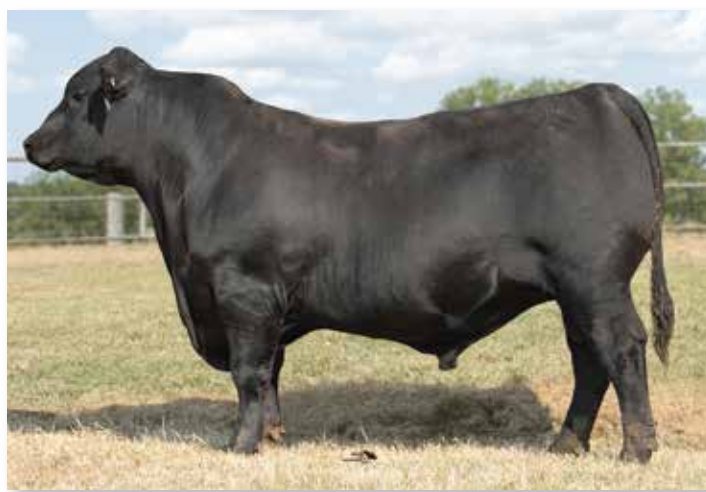
Lot 108 | TANNER ULTRABLACK 535L

He is a calving ease prospect with an adj. 205 of 735 lbs. Pretty impressive! He records big growth, top 10% IMF and a big Terminal Index which equates to $B. His great granddam was on of the high selling females at the Calyx Star Dispersal.