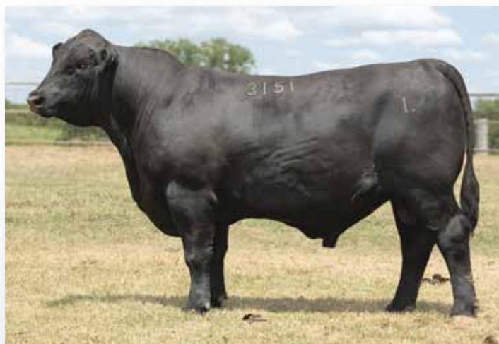
Lot 109 | TANNER ULTRABLACK 3151L

His dam is SAV bred. His sire is our New Vision son, 12C8. He records top 30% YW, IMF and Terminal Index with top 10% Fertility Index.