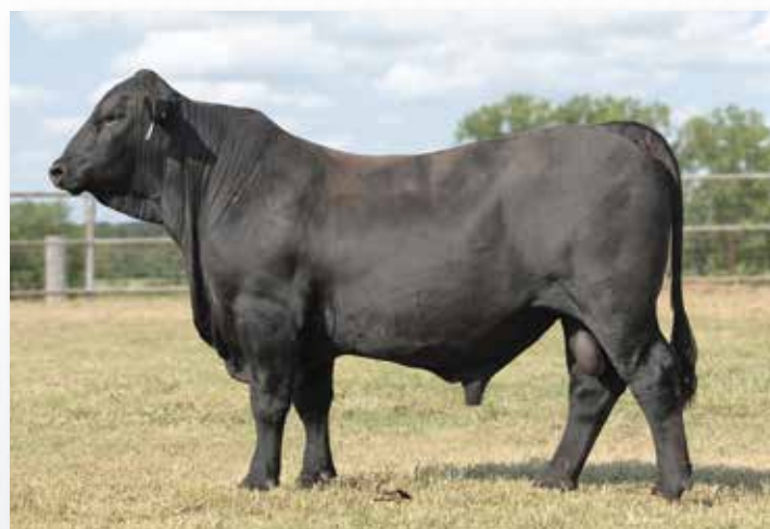
Lot 116 | TANNER NEW VISION 48L

He is a son of our New Vision herd sire. His dam is by Hollywood and out of a Ranger daughter. He records big YW and REA with above breed average indexes.