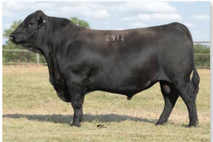
Lot 2 | TANNER SUMMATION 2912

A son of KCF Bennett Summation E802, one of several half brothers offered in sale with 12 leading traits. Top 5% YW and $C, Top 10% WW, CW, $F and $B, Top 15% Milk and RE, Top 20% $M and %G, Top 25% Marb and Top 30% $W. His dam posts 1 @ 110 WR and 1 @ 106 YR with 1st calf. Outstanding Weaning and Yearling Growth, Excellent Milk, Good Carcass