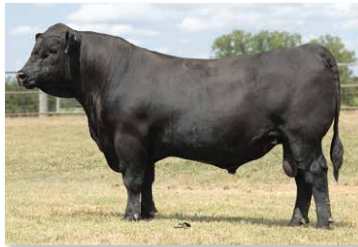
Lot 56 | TANNER BLUE SKY 3310

The son of 44 Blue Sky 7226 with leading 9 traits. Top 10% RE, Top 15% YW and Fat, Top 20% WW, Top 25% Milk and $F, Top 30% CW and $B, Top 35% $G. His dam posts 2 @ 104 WR and 2 @ 109 YR with an average 355 day calving interval on 2 head. Excellent Weaning and Yearling Growth and Milk, Big Ribeye 15.1 cm