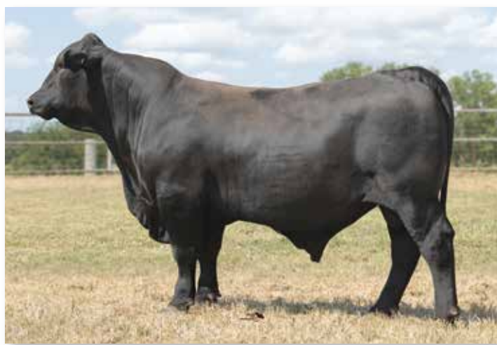
Lot 111 | TANNER ULTRABLACK 271L

This calving ease prospect does it all. He weaned at 758 lbs. Sired by 44 Farms Black Friday, he is out of a second calf Stonewall daughter. He boasts big growth, carcass and Indexes along with his curve bending light birth.