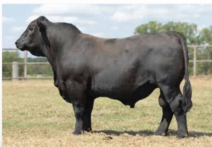
Lot 112 | TANNER COAL TRAIN 546L

His dam is Sleep Easy bred from Cow Creek and records a 368 day calving interval on 7. He is sired by Coal Train, a good Blackhawk son.