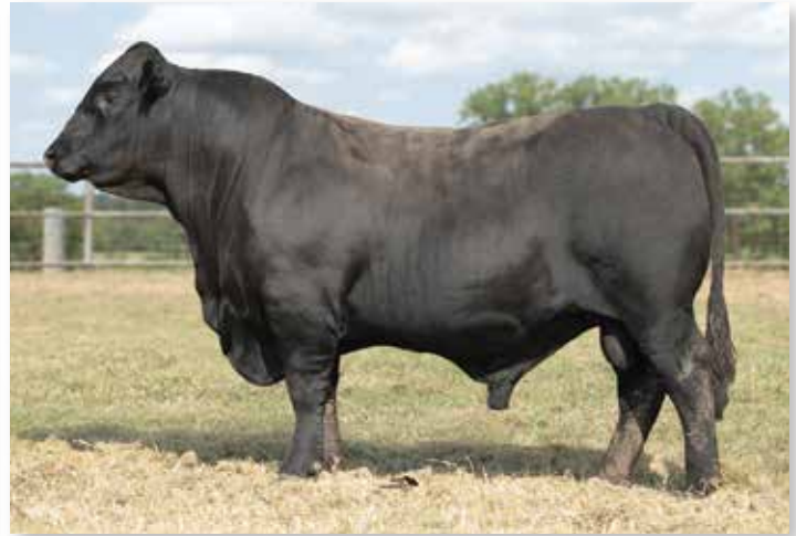
Lot 106 | TANNER ULTRABLACK 779K6