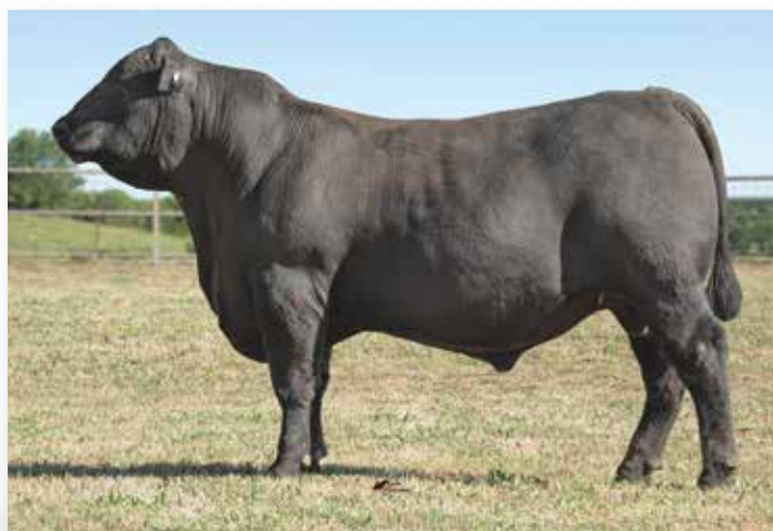
Lot 17 | TANNER SUMMATION 3115

A son of Roseda Powerball23 F091, one of several half brothers offered in sale with 10 leading traits. Top 1% WW and YW, Top 3% $F, Top 4% CW, Top 10% $B, Top 15% $C, Top 20% $W and $G, Top 25% Marb, Top 35% RE. His dam posts 3 @ 107 WR and 3 @ 107 YR. 858 lb Weaning Weight. Outstanding Growth plus Carcass.