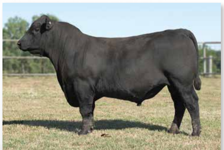
Lot 3 | TANNER DISCOVERY 2918

A grandson of the VAR Discovery 2240 with 9 leading traits. Top 15% $C, Top 20% BW, CED and $M, Top 25% CEM, $F and $G. Top 30% Marb and Fat. His dam posts 3 @ 93 BR, 3 @ 102 WR and 2 @ 103 YR. Calving Ease.