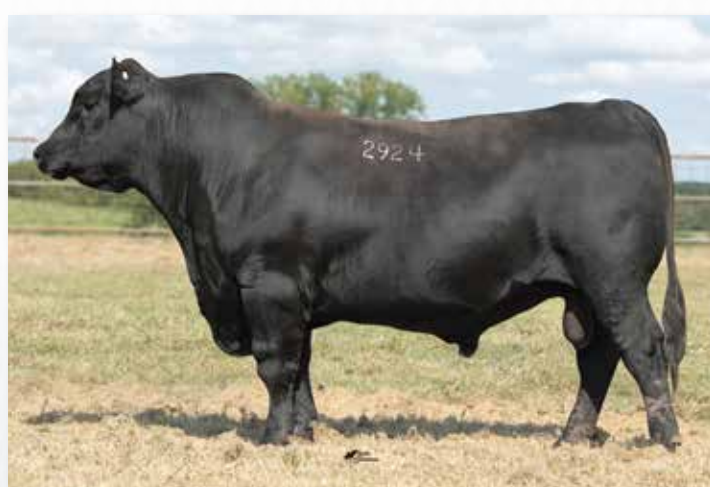
Lot 6 | TANNER HOME TOWN 2924

A son of GAR Home Town with 8 leading traits. Top 10% BW and CED, Top 20% Marb and $G, Top 25% CEM, Top 30% $B and $C, Top 35% RE. This dam posts 7 @ 99 BR, 7 @ 102 WR and 5 @ 103 YR with an average 373 day calving interval. Good Carcass with Maternal Fertility. Big Ribeye 15.2 cm