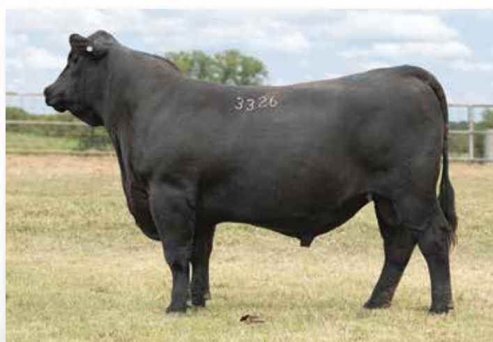
Lot 62 | TANNER BLACK FRIDAY 3326

A son of 44 Black Friday 152H with 10 outstanding traits. Top 4% WW and YW, Top 20% CW, Fat, $G, $F, $B and $C, Top 30% Marb, Top 35% Milk. His dam posts 2 @ 102 WR and 2 @ 106 YR. Outstanding Weaning and Yearling Growth, Milk with Carcass. 804 lb WW