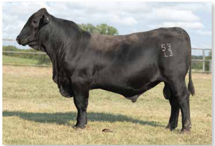
Lot 118 | TANNER ULTRABLACK 53L3

He is a numerically superior UB1 prospect writing an incredible 15 EPD traits ranking in the breed's top 30% or greater. He boasts below breed average BW with elite growth and Terminal Index, big carcass and SC and impressive Fertility Index. He features Rampage and Stonewall in his pedigree and weaned over 750 lbs., as you might expect.