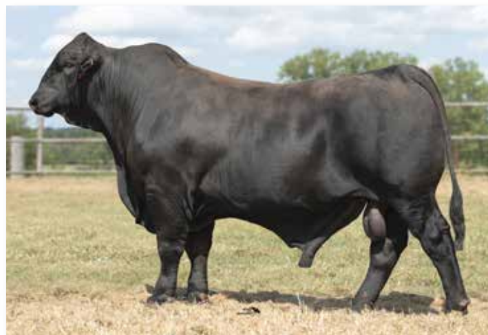
Lot 115 | TANNER ATLANTA 811L

He is a bigger growth Atlanta son featuring Three D and Singletary on the dam side. He records big WW, carcass and Index values.