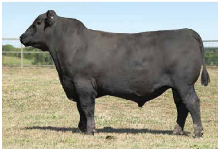
Lot 18 | TANNER KNOW HOW 3117

The only Hoover Know How son offered in sale with Top 20% Fat, Top 30% $F and Top 35% $B. His Pathfinder dam posts 5 @ 113 WR and 5 @ 110 YR with an average 367 day calving interval on 5 head. This bull had a 799 lb WW and 1292 lb YW from dam that has a history of producing heavy weight calves. Maternal Fertility