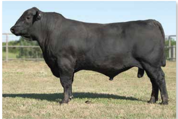
Lot 21 | TANNER SUMMATION 3127

A son of KCF Bennett Summation E802, one of several half brothers offered in sale with 10 leading traits. Top 5% $F, Top 10% WW, YW and CW, Top 15% Milk, Top 20% $C, Top 25% RE and $W, Top 30% $M and $B. His dam posts 6 @ 105 WR and 6 @ 109 YR with an average 360 day calving interval on 6 head. Excellent Weaning and Yearling Growth with Carcass plus Milk