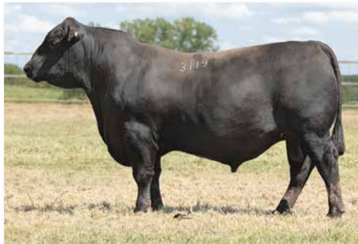
Lot 19 | TANNER BLACK FRIDAY 3119

A son of Tanner Farms herd sire 44 Black Friday 152H sporting 12 leading traits. Top 10% WW, Top 15% Fat, Top 20% YW and $C, Top 25% $W, $G and $B, Top 30% $M and $F, Top 35% Milk, CW and RE. His dam posts 2 @ 97 BR, 2 @ 103 WR and 2 @ 102 YR. Excellent Weaning and Yearling Growth with Milk. Good Carcass