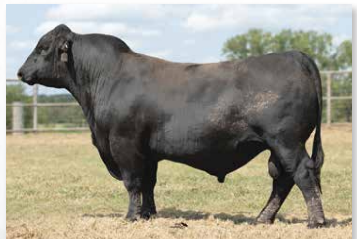
Lot 9 | TANNER HOME TOWN 2927

A son of GAR Home Town with 10 leading traits. Top 10% YW, Fat, $F, $B and $C, Top 15% WW, RE and $G, Top 20% CW, Top 25% Marb. His dam posts 1 @ 109 WR and 1 @ 112 YR with her 1st calf. Good Weaning and Yearling Growth with Carcass