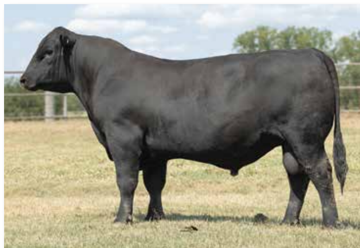
Lot 61 | TANNER BLUE SKY 3325

A son of 44 Blue Sky 7226 with 8 leading traits. Top 10% Fat, Top 20% YW, $G and $B, Top 25% WW, Top 30% Marb AND $F, Top 35% $C. Excellent Weaning and Yearling Growth with Carcass.