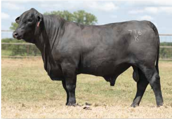
Lot 105 | TANNER NEW VISION 716K