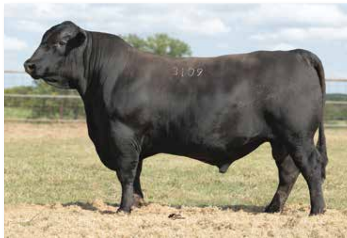
Lot 14 | TANNER SUMMATION 3109

A son of KCF Bennett Summation E802, one of several half brothers offered in sale with 12 leading traits. Top 3% YW, Top 4% $F, Top 5% RE, Top 10% WW and CW, Top 15% CED, Top 20% Milk and $B, Top 25% $W and $C, Top 30% BW and Top 35% CEM. His dam posts 1 @ 86 BR, 1 @ 102 WR and 1 @ 111 YR with her 1st calf. Excellent Weaning and Yearling Growth, with Calving Ease, Good Maternal Qualities Big Ribeye 15.5 cm.