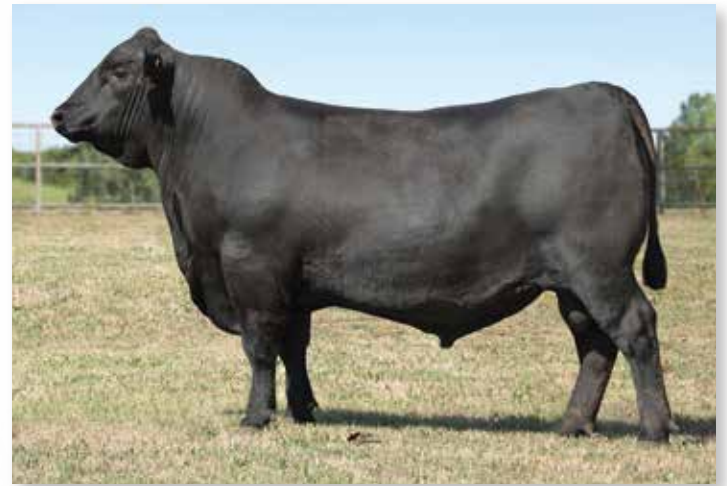
Lot 8 | TANNER SUMMATION 2926

A son of KCF Bennett Summation E802, one of several half brothers offered in sale with 13 leading traits. Top 4% WW and YW, Top 5% CW and $F, Top 10% $C, Top 15% Milk, $M and $B, Top 20% RE, Top 25% CED and CEM, Top 30% $M and $G. His dam posts 2 @ 95 BR, 2 @ 112 WR and 2 @ 111 YR with an average 375 day calving interval. Complete Package with calving ease. Weaning Weight 857 lbs. Herd Sire Candidate