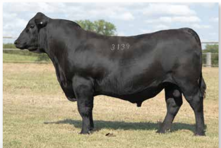
Lot 24 | TANNER DISCOVERY 3139

A grandson of VAR Discovery 2240 with 7 leading traits. Top 20% WW, Top 25% YW, Top 30% $F, Top 35% Marb, $G, $B and $C. His dam posts 5 @ 102 WR. Good Weaning and Yearling Growth plus Carcass.