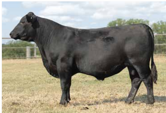
Lot 60 | TANNER SUPPLY CHAIN 3321

The only spring borne of 44 Supply Chain 436 offered in sale. He sports 10 outstanding traits. Top 20% WW and YW, Top 25% CEM, RE, $F and $C, Top 30% CW, $G and $B, Top 35% Fat. His dam posts 3 @ 101 WR and 2 @ 102 YR. Excellent Weaning and Yearling Growth with Carcass.