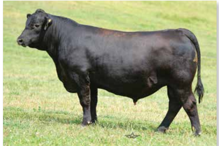
Reference Sire | ROSEDA POWERBALL23 F091