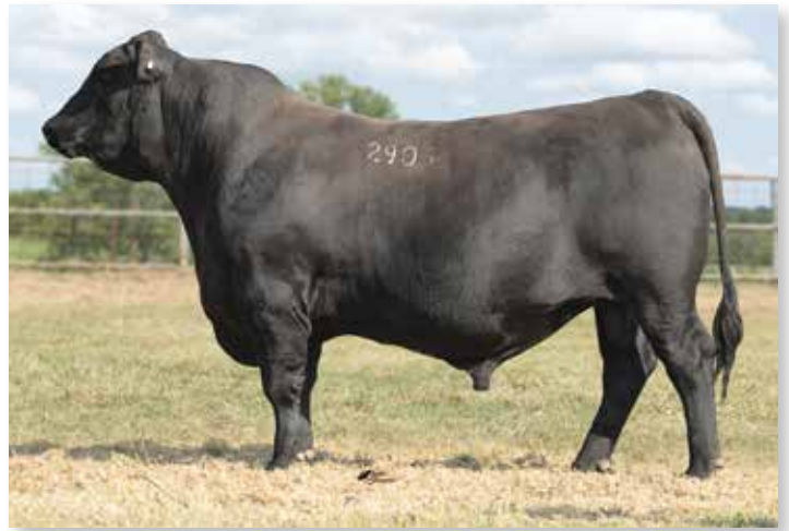
Lot 1 | TANNER PUBLIC TRUST 2905

A son of 44 Public Trust F901 with 9 leading traits. Top 20% BW and Fat, Top 25% CEM, $M, $G and $C, Top 30% CED and Marb, Top 35% $B. His dam posts 1 @ 92 BR, 1 @ 102 WR and 1 @ 103 YR as her 1st calf. Good Weaning and Yearling Growth with Calving Ease. Big Ribeye 15.4 CM